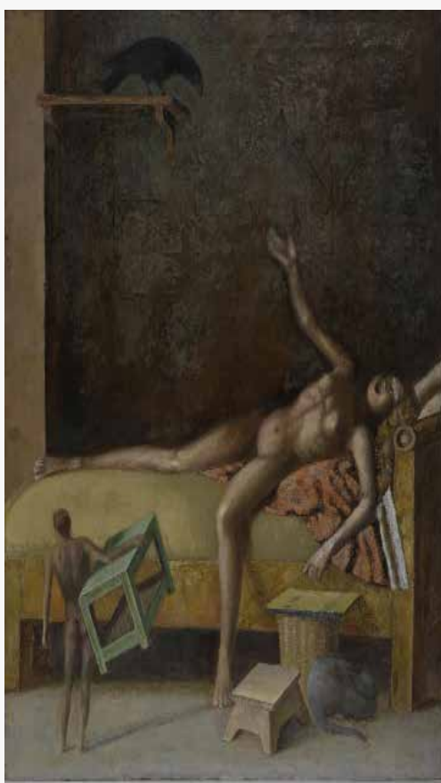
▲ BALTHUS. GRANDE COMPOSITION AU CORBEAU. 1883-86 © GIFT OF DONALD NEWHOUSE TO THE CENTRE POMPIDOU FOUNDATION

PARIS JUNE 18-20 | LONDON FRIEZE OCTOBER 12-16 | PARIS FIAC OCTOBER 19-23 | DALLAS NOVEMBER 4-7 MIAMI ART BASEL NOVEMBER 30- DECEMBER 4