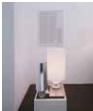
Josef Strau Bruno Schulz , 2007 Fabric, plastics, lacquer, metal, silver leaf, electrical components, wooden plinth, framed photograph (unique) Sculpture: 39 x 26 5/8 x 19 inches; photograph 32 5/8 x 23 1/4 inches Gift of Thea Westreich Wagner and Ethan Wagner