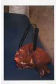
Josephine Pryde Liver (Pen Holder) , 2006 C-print, Edition 1 of 3 15 1/4 x 10 1/4 inches Gift of Thea Westreich Wagner and Ethan Wagner