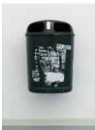
Klara Liden Untitled (Trash Can) , 2010 Found trashcan Unique Gift of Thea Westreich Wagner and Ethan Wagner