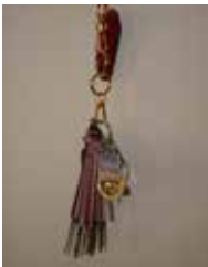
Claire Fontaine Instructions for the Sharing of Private Property , 2006 Digital video, color and sound Running time 45 minutes and 23 seconds Edition 1 of 5 + 2 AP Gift of Thea Westreich Wagner and Ethan Wagner