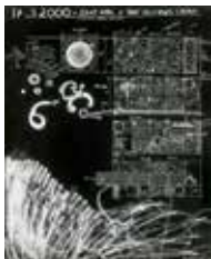
Keith Tyson Studio Wall Drawing, (Right Wall + Roof Sections Ghent) , 2000 Mixed media on paper 60 3/4 x 47 5/8 inches Gift of Thea Westreich Wagner and Ethan Wagner