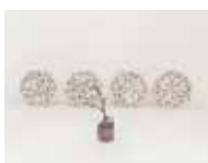
Annette Kelm Untitled (plates) , 2010 C-print, Edition 5 of 5 29 1/8 x 39 3/8 inches Gift of Thea Westreich Wagner and Ethan Wagner