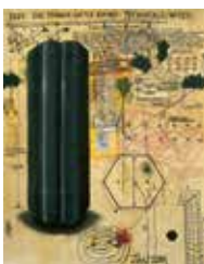
Keith Tyson Studio Wall Drawing, The Thinker (after Rodin) - Technicals / Notes, 2001 Mixed media on paper 60 x 47 3/4 inches Gift of Thea Westreich Wagner and Ethan Wagner