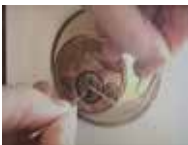
Claire Fontaine Passe-Partout (Zurich) Sculpture , 2007 Hacksaw blades, key chains and mixed media Variable dimensions Unique Gift of Thea Westreich Wagner and Ethan Wagner