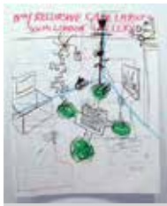
Keith Tyson Studio Wall Drawing: Game at South London Gallery, 2001 Mixed media on paper 59 3/4 x 47 3/4 inches Gift of Thea Westreich Wagner and Ethan Wagner