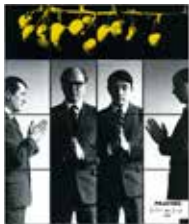
Gilbert & George Praying , 1980 Sixteen-panel photo piece 94 1/2 x 78 3/4 inches overall Unique