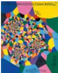
Keith Tyson Studio Wall Drawing, (A Window on an Infinite Cellular Blanket V2), 2000 Mixed media on paper 60 3/4 x 47 5/8 inches Gift of Thea Westreich Wagner and Ethan Wagner