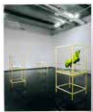
Simon Starling work, made light, in light of nature , 2003 Suite of four vitrines in wood and glass, aluminum Overall dimensions vary depending due to installation; 2 vitrines 58 3/4 x 21 1/2 x 26 inches; 1 vitrine 73 x 33 5/8 x 33 5/8 inches; 1 vitrine 62 5/8 x 42 x 12 3/4 inches Gift of Thea Westreich Wagner and Ethan Wagner