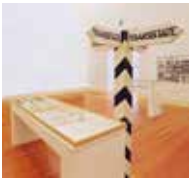
Vitaly Kormar and Alexander Melamid Trans-State, 1977 Mixed media installation with three cases containing documents, a scroll, and a wooden border/direction post Dimensions variable Gift of the Grinstein Family