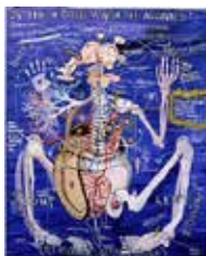
Keith Tyson Studio Wall Drawing: A Dissection of the Agonies, 2001 Mixed media on paper 59 1/2 x 47 1/4 inches Gift of Thea Westreich Wagner and Ethan Wagner