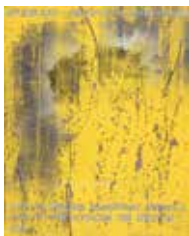
Keith Tyson Studio Wall Drawing: Miracle at the Conservationists, June 24, 2002, 2002 Mixed media on paper 59 1/2 x 47 1/4 inches Gift of Thea Westreich Wagner and Ethan Wagner