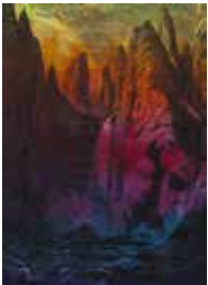
Friedrich Kunath Return to Forever (Carlito), 2010 Acrylic on canvas 114 x 82 inches (289.6 x 208.3 cm.) Gift of Andrea Rosen