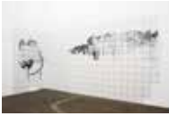
Matias Faldbakken Remainder VII , 2009 Felt pen on ceramic tiles mounted on wall 95 3/4 x 231 inches, format variable Gift of Thea Westreich Wagner and Ethan Wagner