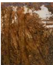
Keith Tyson Studio Wall Drawing, Chemical Hitchhikers Await a Vehicle to Another World, 2001 Mixed media on paper 60 x 47 3/4 inches Gift of Thea Westreich Wagner and Ethan Wagner