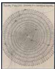
Keith Tyson Studio Wall Drawing: Drowning in a teleological labyrinth (7th August 2003), 2003 Mixed media on paper 61 3/4 x 49 5/8 inches Gift of Thea Westreich Wagner and Ethan Wagner