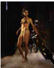
Richard Prince Spiritual America IV , 2005 Ektacolor photograph 89 1/2 x 71 inches; 227,30 x 180,30 cm Edition 2 of 6 Signed, numbered, and dated R. Prince 2/6 2005 (verso) Gift of Per Skarstedt