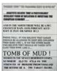
Keith Tyson Studio Wall Drawing: The Paradigm Shift is Upon Us, 2001 Mixed media on paper 60 x 47 3/4 inches Gift of Thea Westreich Wagner and Ethan Wagner