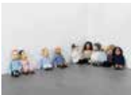
Philippe Parreno and Rirkrit Tiravanija Puppets , 2009 Set of 10 puppets: 10 ceramic heads, 20 ceramic hands, 20 ceramic feet, clothes and stuffing Dimension vary: approximately 43 1/4 - 47 1/4 inches in height Gift of Thea Westreich Wagner and Ethan Wagner