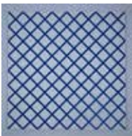
Heimo Zobernig Untitled , 1989 Mirror synthetic lacquer, cardboard 63 3/8 x 39 5/8 x 4 inches Gift of Thea Westreich Wagner and Ethan Wagner