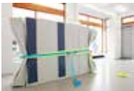
Matias Faldbakken Untitled (Locker Sculpture #01) , 2010 Mixed media sculpture, metal lockers and lever straps 72 x 119 3/4 x 19 1/2 inches Gift of Thea Westreich Wagner and Ethan Wagner