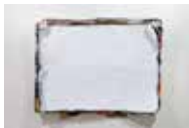
Klara Liden Untitled (Poster Painting) , 2007 Posters and glue 30 x 24 inches (approximately) Unique Gift of Thea Westreich Wagner and Ethan Wagner