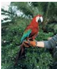
Annette Kelm Turning into a Parrot , 2003 C-print, Edition 5 of 5 + 2 AP 19 5/8 x 15 3/4 inches Gift of Thea Westreich Wagner and Ethan Wagner