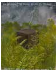
Keith Tyson Studio Wall Drawing: "The block begins its journey...", 2003 Mixed media on paper 61 3/4 x 49 5/8 inches Gift of Thea Westreich Wagner and Ethan Wagner