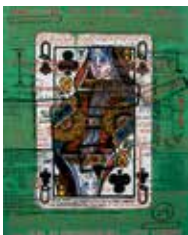
Keith Tyson Studio Wall Drawing: Pick a Card, Any Card - The Properties of One, 2001 Mixed media on paper 60 x 47 3/4 inches Gift of Thea Westreich Wagner and Ethan Wagner