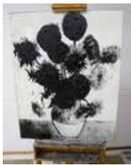
Mark Alexander Via Negativa (Sunflower Painting No. 13), 2008 Oil on canvas 28 3/4 x 36 1/4 inches Gift of Thea Westreich Wagner and Ethan Wagner