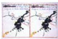
Keith Tyson Studio Wall Drawing (There is Another World...Part 1 and Part 2), August 2, 2001 Mixed media on paper Two parts, 61 3/4 x 49 5/8 inches each Gift of Thea Westreich Wagner and Ethan Wagner