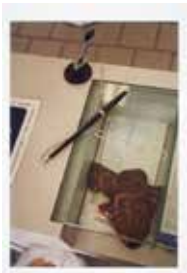
Josephine Pryde Liver (Paying in Slips) , 2006 C-print, Edition 1 of 3 15 1/4 x 10 1/4 inches Gift of Thea Westreich Wagner and Ethan Wagner