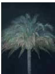
Annette Kelm I Love the Little Baby Giant Panda; I'd Welcome One to My Veranda , 2003 Seven C-prints, Edition 3 of 5 + 2 AP 19 5/8 x 15 3/4 inches Gift of Thea Westreich Wagner and Ethan Wagner