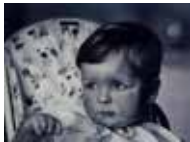
Mark Alexander Self-Portrait II, 1997-99 Oil on canvas in artist's frame, glazed 39 1/2 x 49 1/2 inches Gift of Thea Westreich Wagner and Ethan Wagner