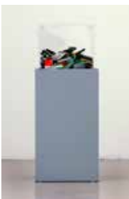
Claire Fontaine Tout objet déposé ici sera détruit / Any item left here will be destroyed, V.I. , 2007 Wood, melamine, plexiglass vitrien, scissors, knives, penknives, gaffer tape, razors, box-cutters, nunchucks, knuckle-duster, etc. 45 1/4 x 17 1/4 x 17 1/4 inches Edition 1 of 5 Gift of Thea Westreich Wagner and Ethan Wagner