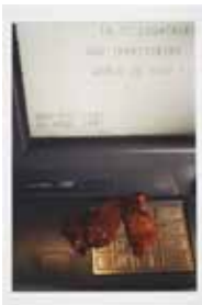
Josephine Pryde Liver (World is your ATM) , 2006 C-print, Edition 2 of 3 15 1/4 x 10 1/4 inches Gift of Thea Westreich Wagner and Ethan Wagner