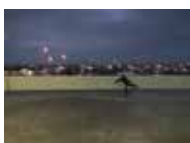
Klara Liden Corps de Ballet , 2010 Video Edition 1 of 5 Gift of Thea Westreich Wagner and Ethan Wagner