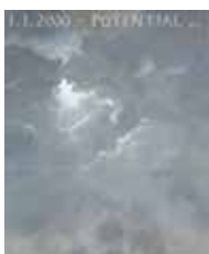
Keith Tyson Studio Wall Drawing, (Potential...) , 2000 Mixed media on paper 60 3/4 x 47 5/8 inches Gift of Thea Westreich Wagner and Ethan Wagner