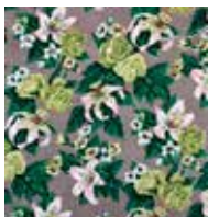
Annette Kelm Big Print #5 (Fazenda Lily - gray background - cotton fall 1947 design, Dorothy Draper, courtesy Schumacher & Co.) , 2007 C-print, AP 1, Edition of 5 + 2 AP 44 1/16 x 39 1/2 inches Gift of Thea Westreich Wagner and Ethan Wagner