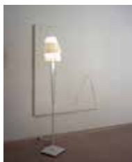
Josef Strau The Assistant , 2008 Ink, pencil, pearls, and adhesive on canvas; mixed media lamp Painting: 50 x 48 inches; overall dimensions variable Gift of Thea Westreich Wagner and Ethan Wagner