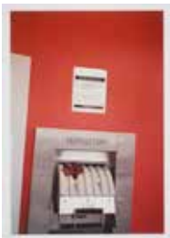
Josephine Pryde Liver (Depository) , 2006 C-print, Edition 3 of 3 15 1/4 x 10 1/4 inches Gift of Thea Westreich Wagner and Ethan Wagner