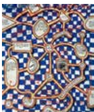
Keith Tyson Studio Wall Drawing, (20 Questions) , 1999 Mixed media on paper 60 3/4 x 47 5/8 inches Gift of Thea Westreich Wagner and Ethan Wagner