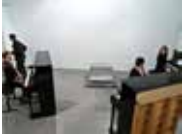
Darren Bader Trois Gnostiennes Dimensions variable Edition 2/2 + 1AP Gift of the artist