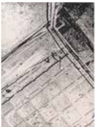
Nate Lowman 41 Worth St. #2, 2016 Alkyd on linen 90 x 66 inches (228.6 x 167.6 cm.) Gift from an anonymous donor