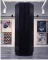
Keith Tyson The Thinker , 2001 Enamel sprayed aluminum, steel, computers, software 118 x 50 x 43 inches (approximate) Gift of Thea Westreich Wagner and Ethan Wagner