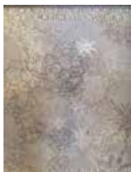
Keith Tyson Studio Wall Drawing, Bouncing Bucephalus, 2000 Mixed media on paper 60 x 47 3/4 inches Gift of Thea Westreich Wagner and Ethan Wagner