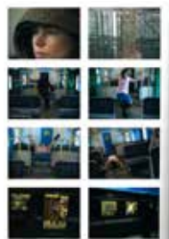
Klara Liden Paralyzed , 2003 DVD, 3 minutes Edition 2 of 10 Gift of Thea Westreich Wagner and Ethan Wagner