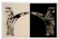
Padraig Timoney Stari Most , 2007 Rabbit skin, glue, pigments, wood on canvas Each diptych: 102 3/8 x 39 3/8 inches; overall 78 3/4 x 102 3/8 inches Gift of Thea Westreich Wagner and Ethan Wagner